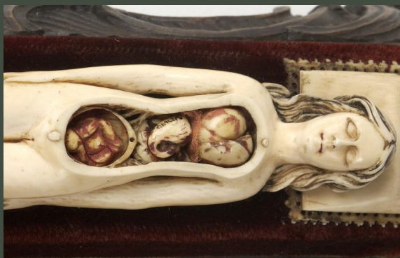
17 th century ivory anatomical model