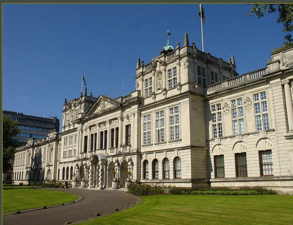
Main Building, Cardiff University, venue for the 2013 conference reception